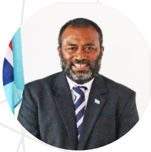
HON. DR. IFEREIMI WAQAINABETE

Hon. Dr. Ifereimi Waqainabete is Fiji's Minister for Health and Medical Services. He has been a clinician/medical officer by profession since 1998 and rose through the ranks to assume the role of a specialist surgeon from 2006 to 2015. He was an Associate Professor in Surgery at the Fiji National University from 2016 to 2018 and to date still maintains the passion and enthusiasm in this field of medical care. He is currently the President of the Pacific Islands Surgeons Association. Among his notable accolades. He was a recipient of the prestigious Rowan Nicks Fellowships & Scholarships whereby he assumed the position of a Senior Registrar, General Surgery at the Palmerston North Hospital in New Zealand in 2004 and 2005. He also spent 2 years as a Clinical Surgical Fellow at Christchurch Public Hospital and Hon. Lecturer at Otago University.