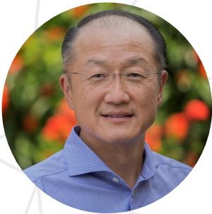
DR. JIM YONG KIM