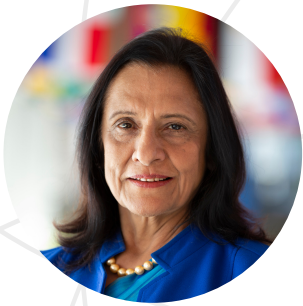
DR. POONAM KHETRUPAL SINGH

Dr. Poonam Khetrupal Singh, an Indian national, became the first woman to assume the office of WHO Regional Director for South-East Asia on 1 February 2014. Prior to that she served for over two decades as a civil servant in India as a member of the Indian Administrative Services and was the Health Secretary of the State of Punjab. In 1987 Dr. Khetrupal Singh moved to the Health, Population and Nutrition Department of The World Bank. In 1998 she joined WHO headquarters as Executive Director, Sustainable Development and Healthy Environments Cluster. Since becoming Regional Director in 2014, Dr. Khetrupal Singh has marshaled her full strategic acumen in service of the Region's Member States, which together account for more than a quarter of humanity. This can be witnessed in her decision to consult Member States on their priorities and challenges and -- with their further input -- develop a series of Flagship Priority Programmes that have since been pursued with tenacity and high-level resolve, and which have borne many successes. In 2019 she got nominated for a second term as Regional Director. While continuing to pursue the Flagship Priorities, Dr. Khetrupal Singh has articulated the strategic axes on which her vision for the Region hinges. These include sustaining the Region's many gains, accelerating progress, and harnessing the full power of innovation to ensure all people everywhere can access the services they need, without facing financial hardship.