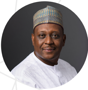
DR. MUHAMMAD ALI PATE

Dr. Muhammad Ali Pate is the Global Director, Health, Nutrition and Population (HNP) Global Practice of the World Bank and the Director of Global Financing Facility for Women, Children and Adolescents (GFF), based in Washington DC. Dr. Pate was until recently the Chief Executive Officer of Big Win Philanthropy, based in the UK, and prior to that held several senior positions, including that of Minister of State for Health in the Federal Republic of Nigeria. He was previously in the World Bank Group where he joined as a Young Professional in 2000 and worked on health issues in several regions including Africa and the East Asia and Pacific.