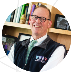
DR. PAUL FARMER

Paul Farmer, MD, PhD, is Kolokotronis University Professor and Chair of the Department of Global Health and Social Medicine at Harvard Medical School, Chief of the Division of Global Health Equity at Brigham and Women's Hospital in Boston, and co-founder and Chief Strategist of Partners In Health. Dr. Farmer and his colleagues have pioneered novel, community-based treatment strategies that demonstrate the delivery of high-quality health care in resource-poor settings. He has written extensively on health, human rights, and the consequences of social inequality, and he is a member of the National Academy of Medicine and of the American Academy of Arts and Sciences. His most recent book is Fevers, Feuds, and Diamonds: Ebola and the Ravages of History .