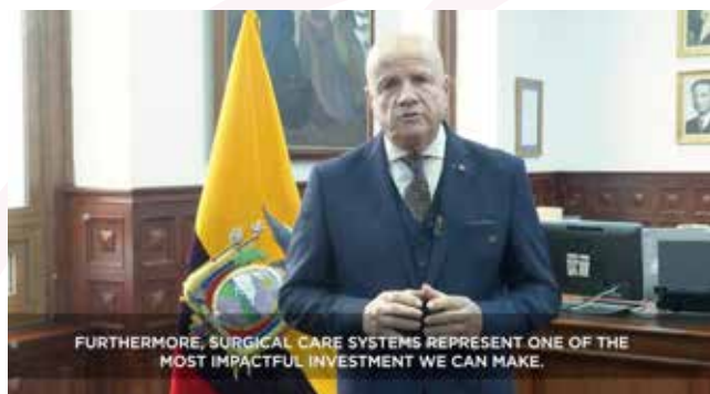
Dr. Alfredo Borrero Vega Vice-President of the Republic of Ecuador