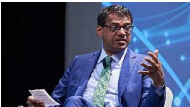
Dr. Atul Gawande Assistant Administrator for Global Health, USAID