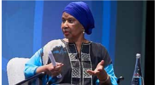
Dr. Phumzile Mlambo-Ngcuka Former Deputy-President of South Africa and UN Under- Secretary-General/Executive Director of UN Women, Member of the GSF Board